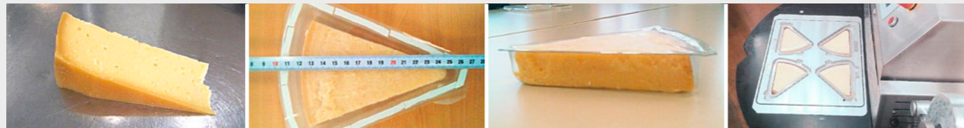
Example of the process for cheese packaging in a premade tray. Packaged on a VARIOVAC Rotarius VG.

VARIOVAC proudly offers the best combination of packaging machine, packaging concept and suitable films and trays. Everything available from one source, for the optimal packaging of your product!